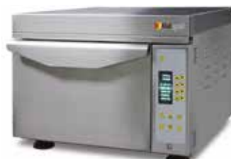
Atollspeed AS 300C