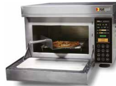
Atollspeed AS 300T