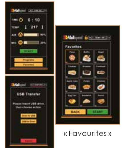
« Favourites »