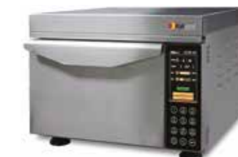
Atollspeed AS 300T