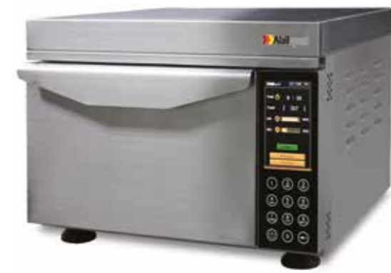
Atollspeed AS 300T

Atollspeed is ideal for bakeries, coffee shops, petrol stations, restaurants, hotel-bars, kiosks... basically anywhere where customers expect "fast" high-quality snacks and meals.